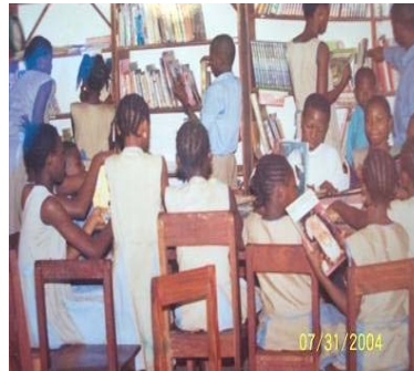
Sabu International School in Conakry, Guinea