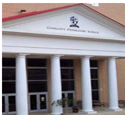
Charlotte Prep School, Charlotte, North Carolina