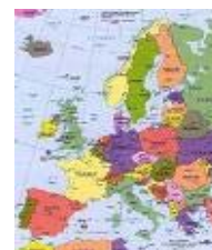
European Schools Project Association