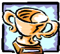
Award Winning Projects

We invite you to explore this idea especially when you think about working with students to look at their own culture. Let us know what you think.