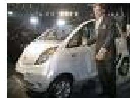
The Nano India's New Small Car

As the number of CultureQuest countries and classrooms grow we anticipate an increasing number of classes participating in the competition each year.